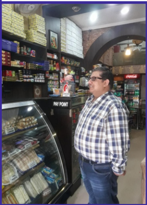
A moment of pure happiness in the heart of Ellora Homeaids' transformation