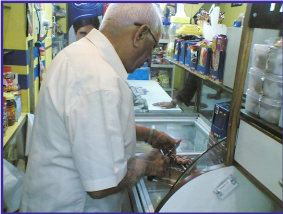
A Picture from the season of 2007 - Dad at the showroom

Unyielding in his commitment, even an unfortunate home accident in 2016 resulting in a broken hip joint did not deter Dad. He continued to embrace work at both Ellora and Opees, dedicating his