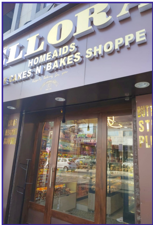
A picture from the season of 2024, newly renovated store of Ellora Homeaids