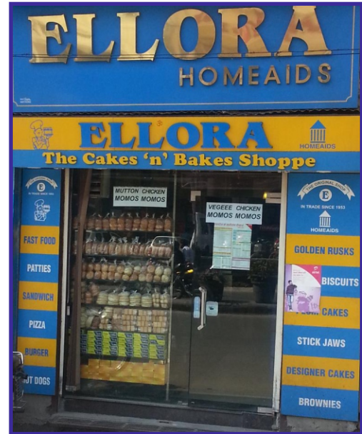
A Picture from the season of 2015

taking online classes from their respective colleges situated in different cities. Now that I have committed myself to bring the publication to its destination.