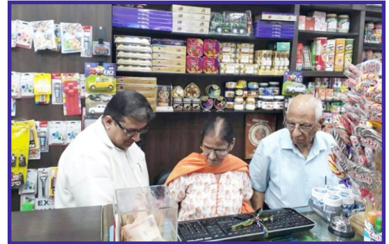
A picture from the season of 2017 - Me with Mom & Dad at the showroom

During our school years, a plethora of responsibilities, from crafting diverse sandwiches to meticulously packaging dry fruit packets and gift boxes, and overseeing the production of plum puddings, fell under Dad's vigilant gaze. Subsequently, in 1998, Dad, along with our family, gave life to "Opees" — a production unit named in his honor.