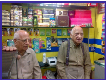
Dad & Tau ji at the showroom