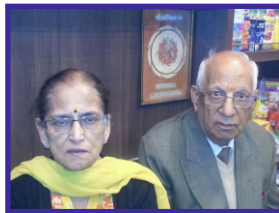
Mom & Dad at the showroom