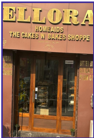
Front Elevation of our newly renovated showroom Ellora Homeaids