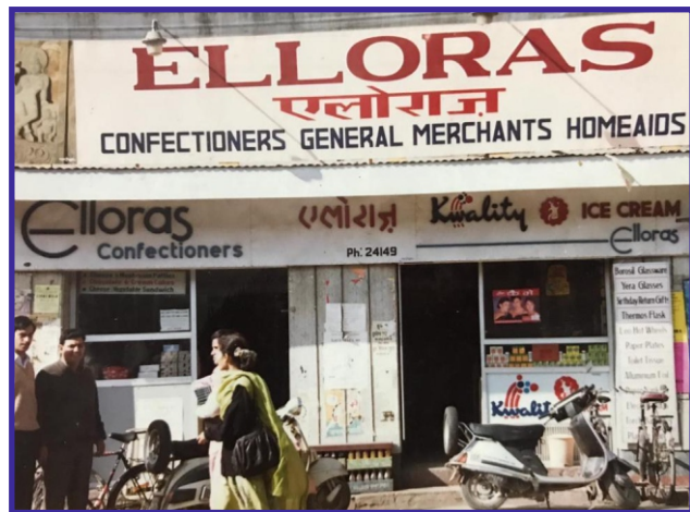
A Picture from the season of 1990