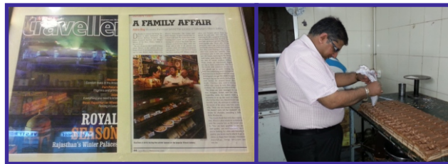
Unveiling the Tapestry of Tradition and Triumph Our Family's Journey Featured in Traveller Magazine