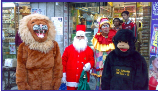
A Picture from the season of 2005

costume. When Santa made his debut appearance at Ellora, staying both inside and outside the premises for three hours, it caused a temporary traffic chaos. The news of the first Santa Claus in Doon at Ellora made headlines in the local newspaper the next morning. Since then, it has become a tradition for Santa Claus to be present outside the outlet on Christmas Eve and Christmas Day. The Santa Claus costumes are now readily available in the market, marking a festive legacy at Ellora.