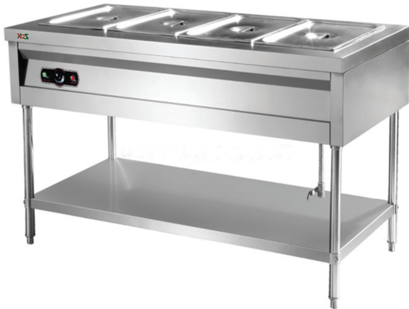
Electric Bain Marie