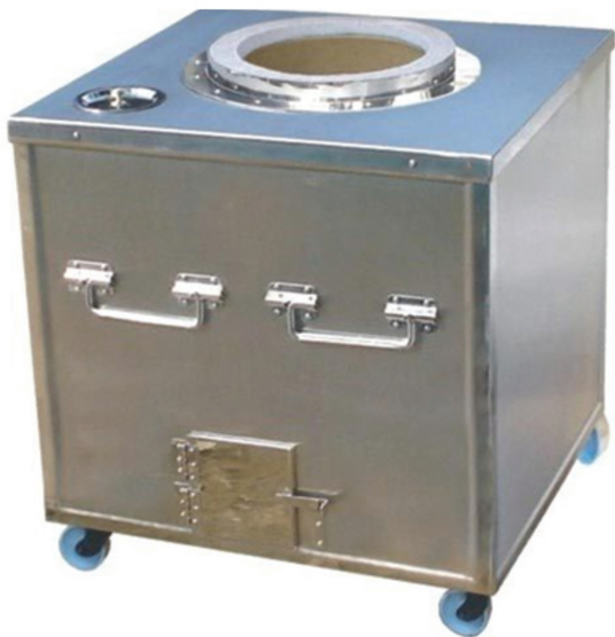
SS Tandoor 26" x 26" x 34"