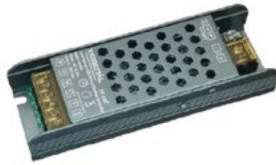
STRIP LIGHT CONTROLLER CCT / RGB