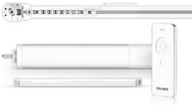
SMART CURTAIN (MOTOR & RAIL)