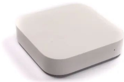
WIRELESS WIFI GATEWAY PRO

Remote Operated / App Based Operations / Alexa Voice Command Support 60Kg Load Bearing DC Motor Complete Set with Toggle & Hook