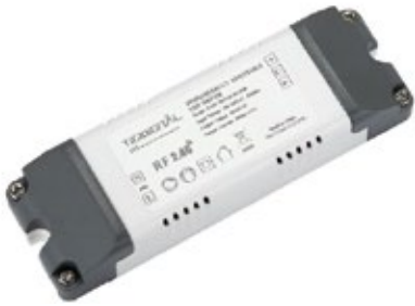
2.4G RF + WIFI SMART DRIVERS